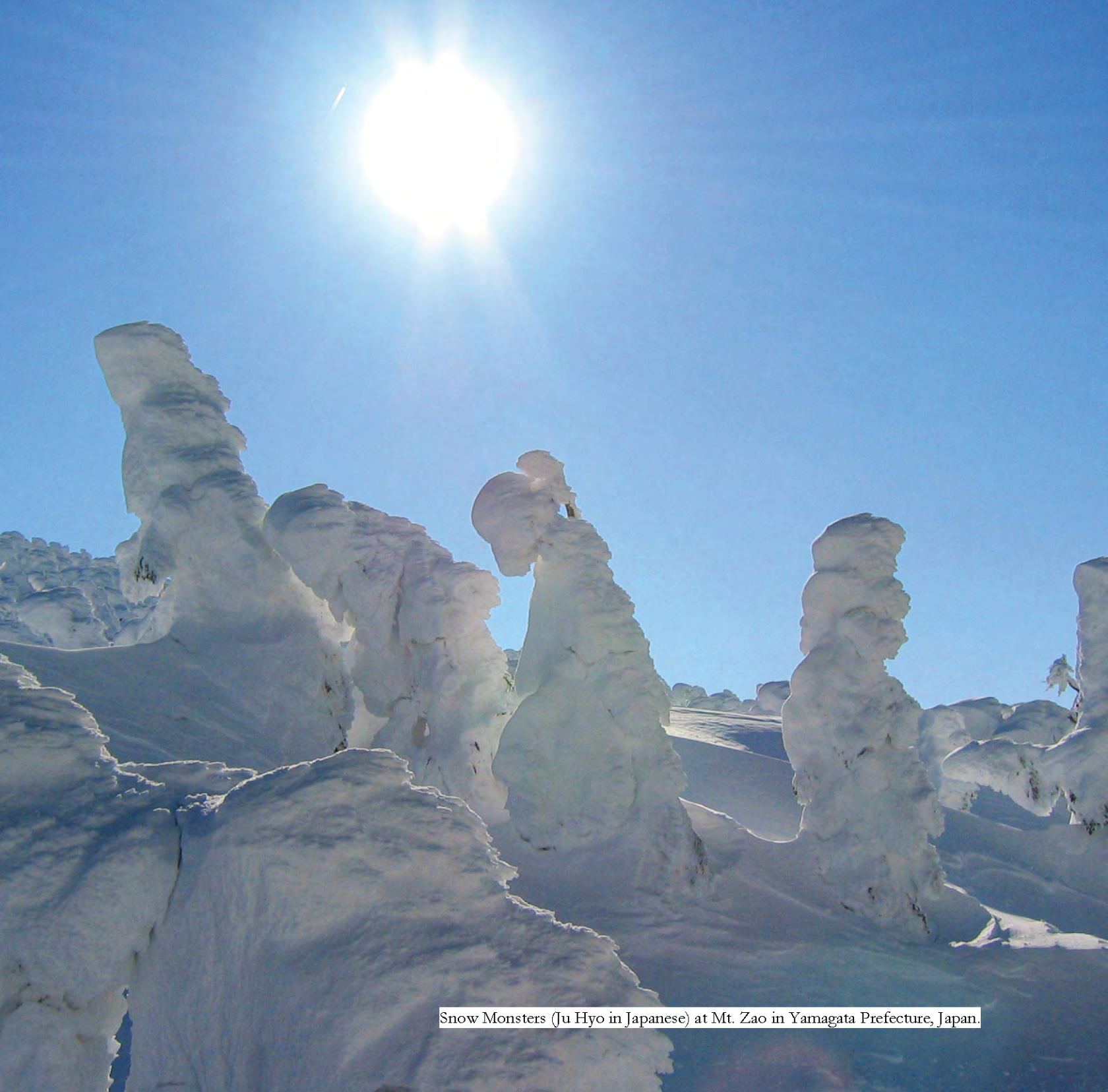
Snow Monsters (Ju Hyo in Japanese) at Mt. Zao in Yamagata Prefecture, Japan.