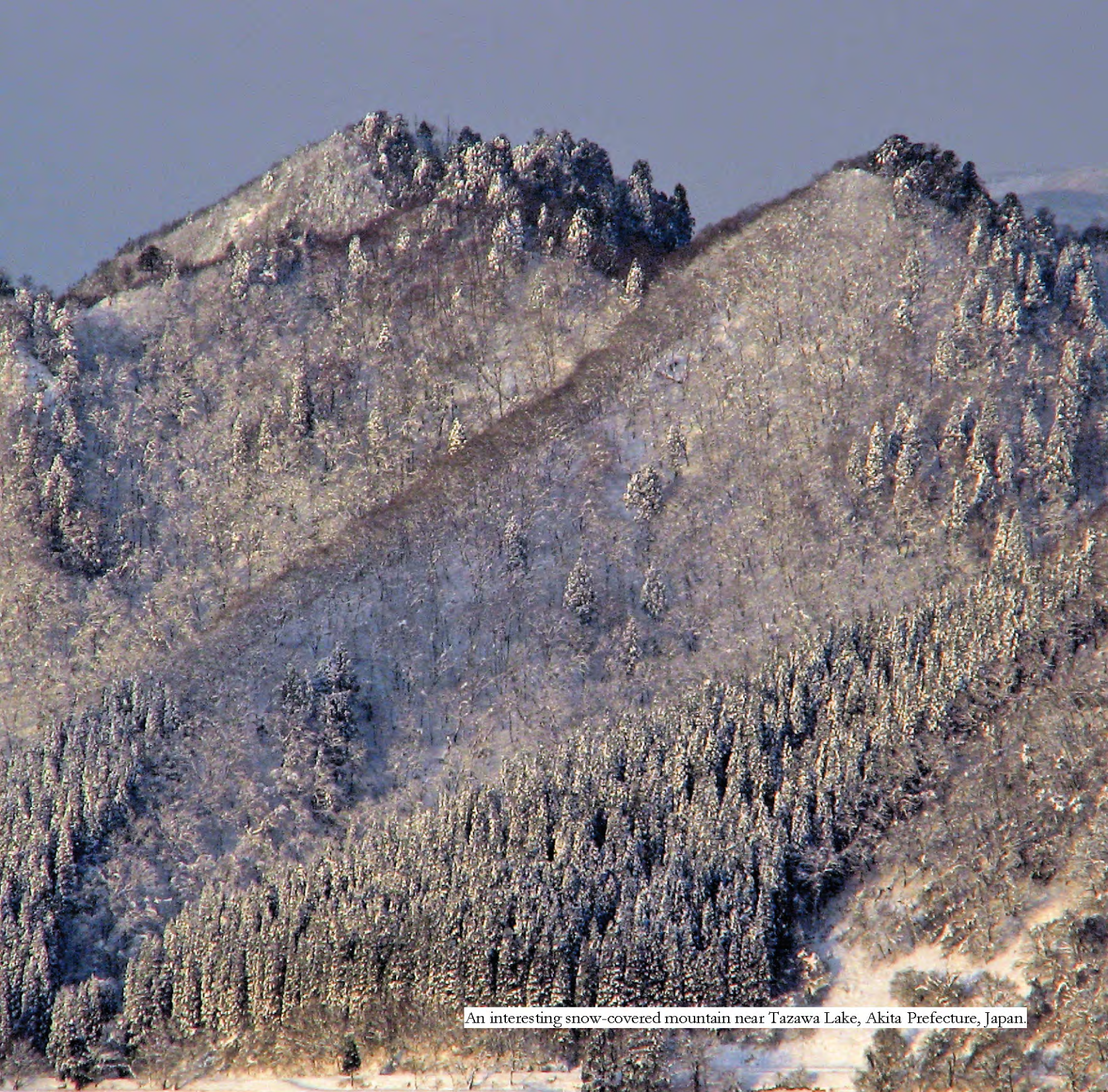
An interesting snow-covered mountain near Tazawa Lake, Akita Prefecture, Japan.