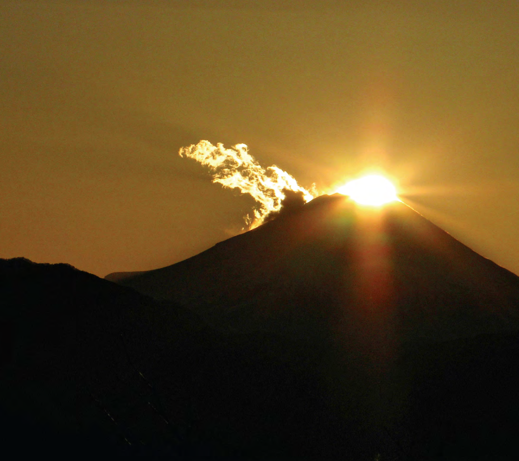
“Diamond Fuji” – the sun setting directly behind Mt. Fuji – from Mt. Takao, Tokyo, Japan.